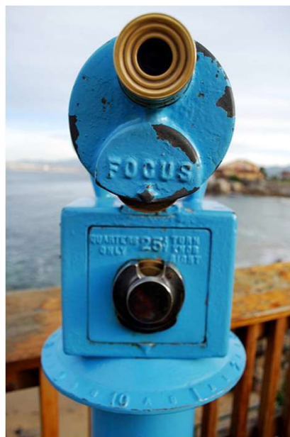
"Focus"

Atla Open Press publishes and hosts open access books & journals that lie at the intersection of librarianship and the study of theology and religion, including works that impact the work of theological librarians, that guide and support innovative library services and enhance professional development.